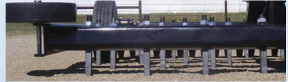
2,5" Offset Tines