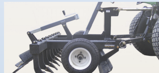
Hooked to a Tractor