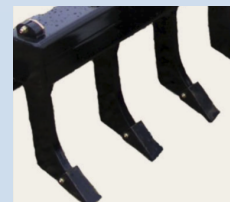
Scarifier Shank and durable, easily replaced Scarifier Teeth