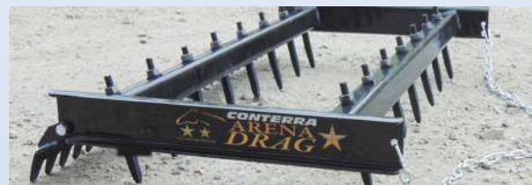
Swept tines help the Drag maintain contact with the ground, reducing the bounce