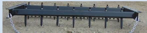
Rear Arena Comb and Two Harrow Tine Bars.