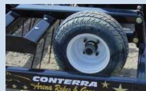
Tires are located inside the frame for optimal grooming coverage.