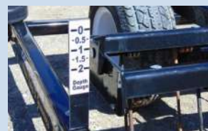
Depth Gauge to monitor tine settings.

📍 712 S Hacienda Rd. Suite 3 Tempe, AZ 85281. ☎ 877-835-0878