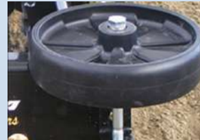
Wall Wheel to help navigate your arena. Mount on left or right - front or back.