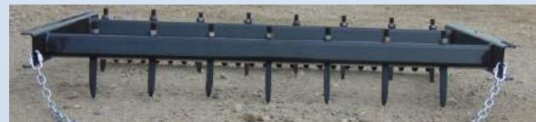
Rear Arena Comb and Two Harrow Tine Bars.