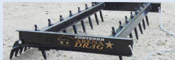
Swept tines help the Drag maintain contact with the ground, reducing the bounce