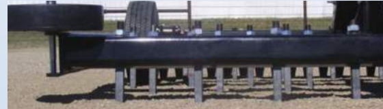
2,5" Offset Tines