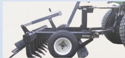
Hooked to a Tractor