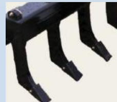
Scarifier Shank and durable, easily replaced Scarifier Teeth