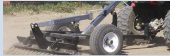
Use with a Tractor, ATV or UTV.