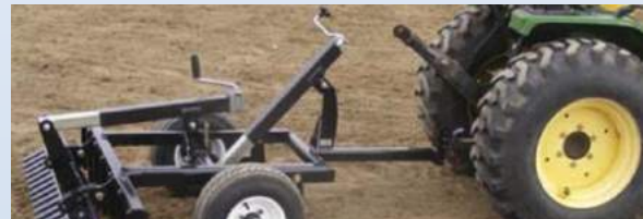
The Adjustable Hitch, allows you to match the height of your pull vehicle.