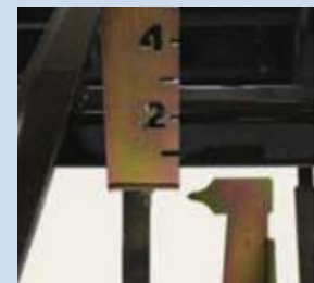
Easy-to-Read Depth Gauge