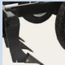
Scarifier Shank and durable, easily replaced Scarifier Teeth