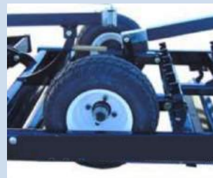
Tires are located inside the frame for optimal grooming coverage.