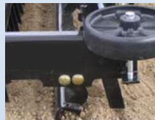
Wall Wheel to help navigate your arena. Mount on left or right; front or back.