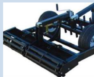
Rear Roller to increase ground stability