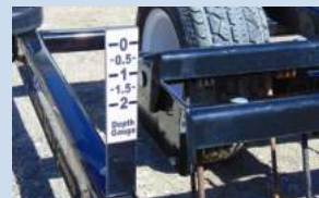
Depth Gauge to monitor tine settings.

📍 7845 E. Gelding Dr. Suite 103 Scottsdale AZ 85260. ☎ 877-835-0878