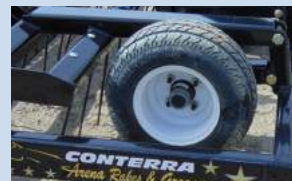
Tires are located inside the frame for optimal grooming coverage.