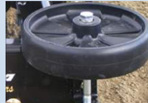
Wall Wheel to help navigate your arena. Mount on left or right - front or back.