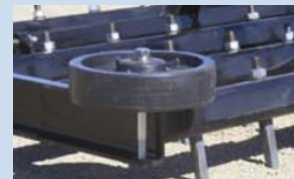
8"x2" No Scuff Wall Wheel