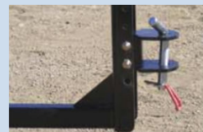
8"x2" Adjustable Hitch