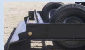
Arena Comb and rear harrow tines. Flat Free Tires located inside the frame for optimal grooming coverage.