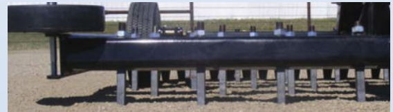
2,5" Offset Tines