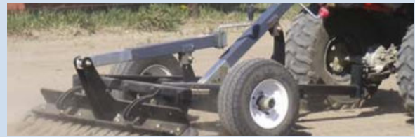
Use with a Tractor, ATV or UTV.