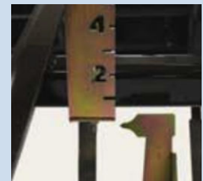
Easy-to-Read Depth Gauge