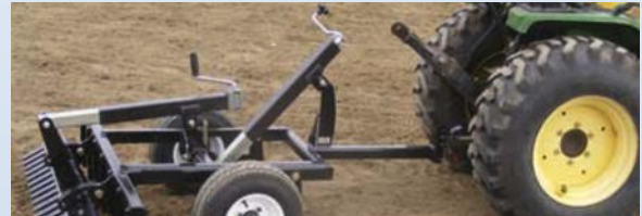
The Adjustable Hitch, allows you to match the height of your pull vehicle.